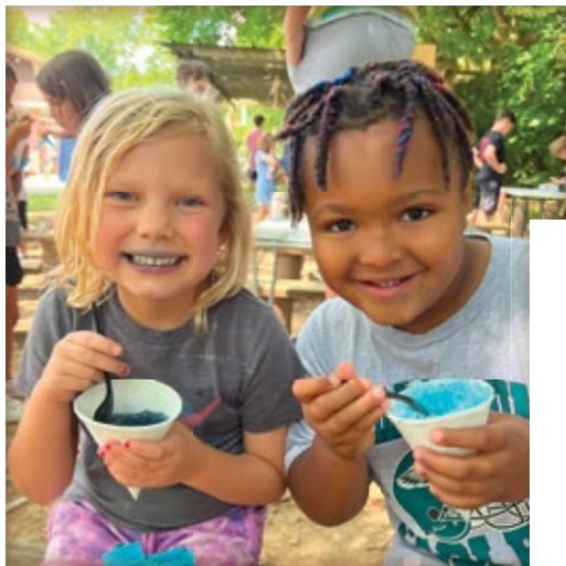
Camp life is sweet!