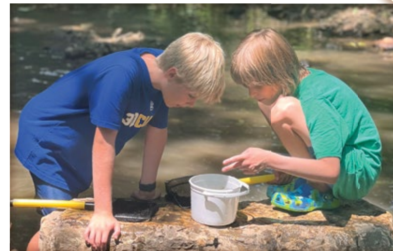
Making new friends of all species

Register online at campshalomdayton.campmanagement.com/enroll