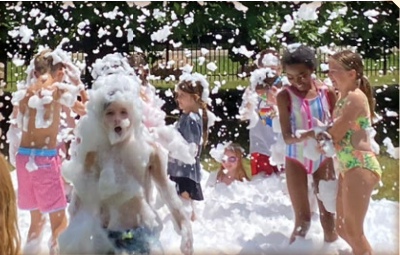
Camp Shalom brings the foam

No Refund: Cancel less than 14 days before the camp week starts.