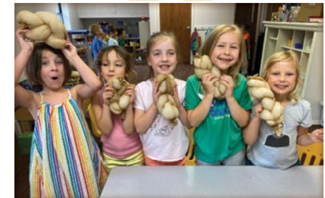
On Fridays, we CHALLAH!