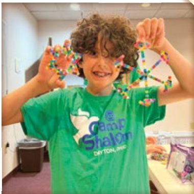
Planning + creativity = ART

These camps have limited space, so register early to ensure your camper's spot! All specialty campers will go swimming & attend field trips with traditional campers.