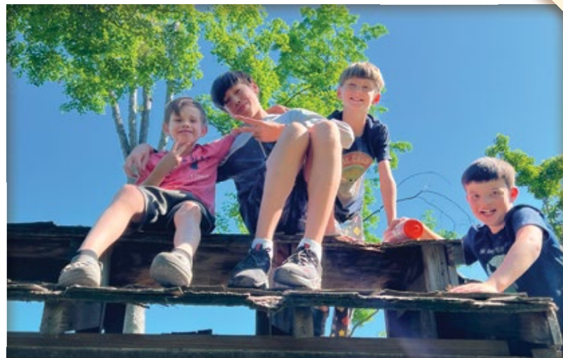
Adventures with friends